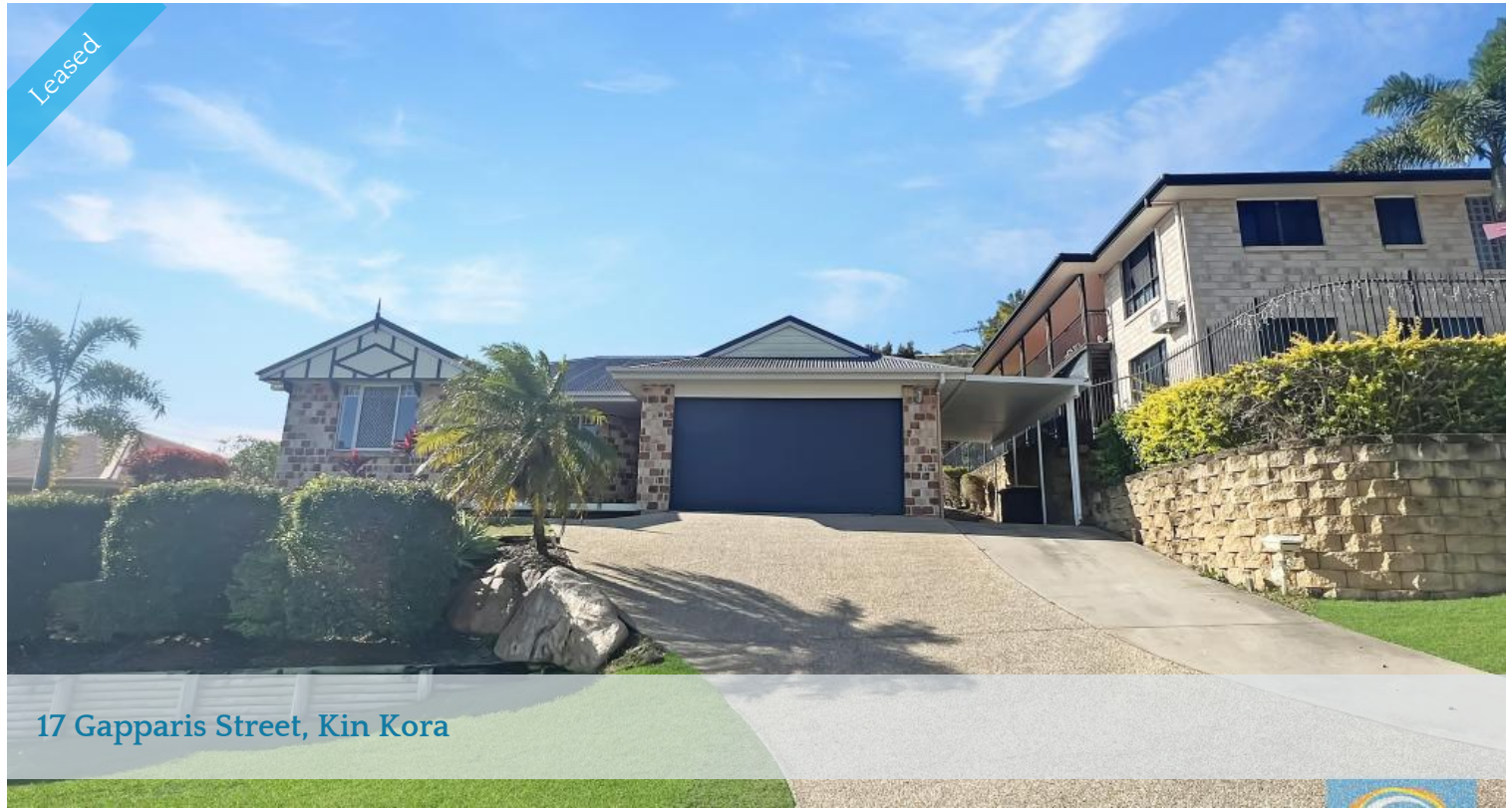
17 Gapparis Street, Kin Kora