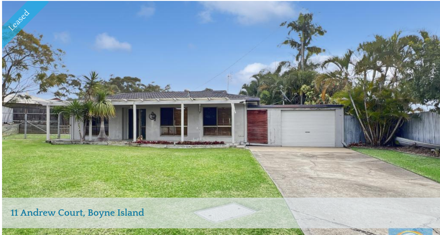
11 Andrew Court, Boyne Island