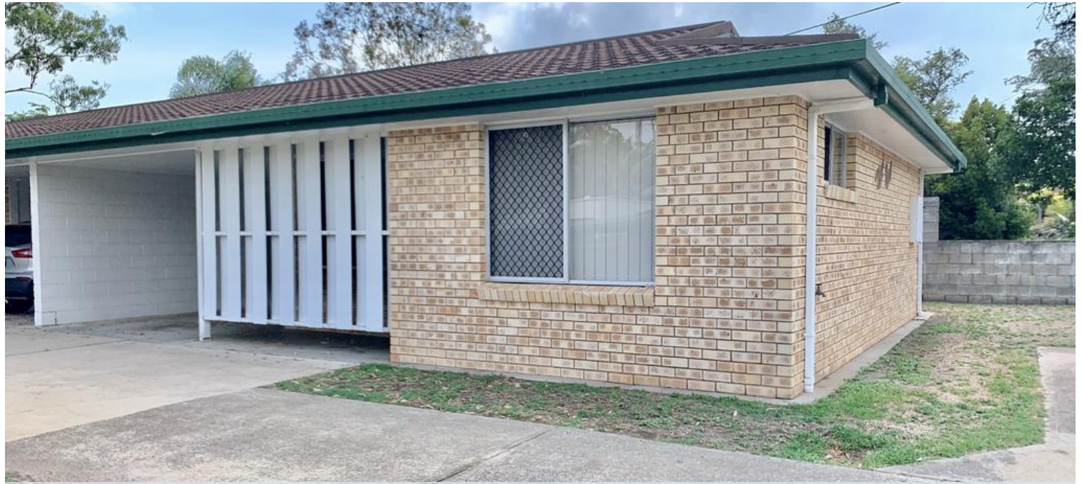
Unit 1, 8 Hayes Avenue, Boyne Island