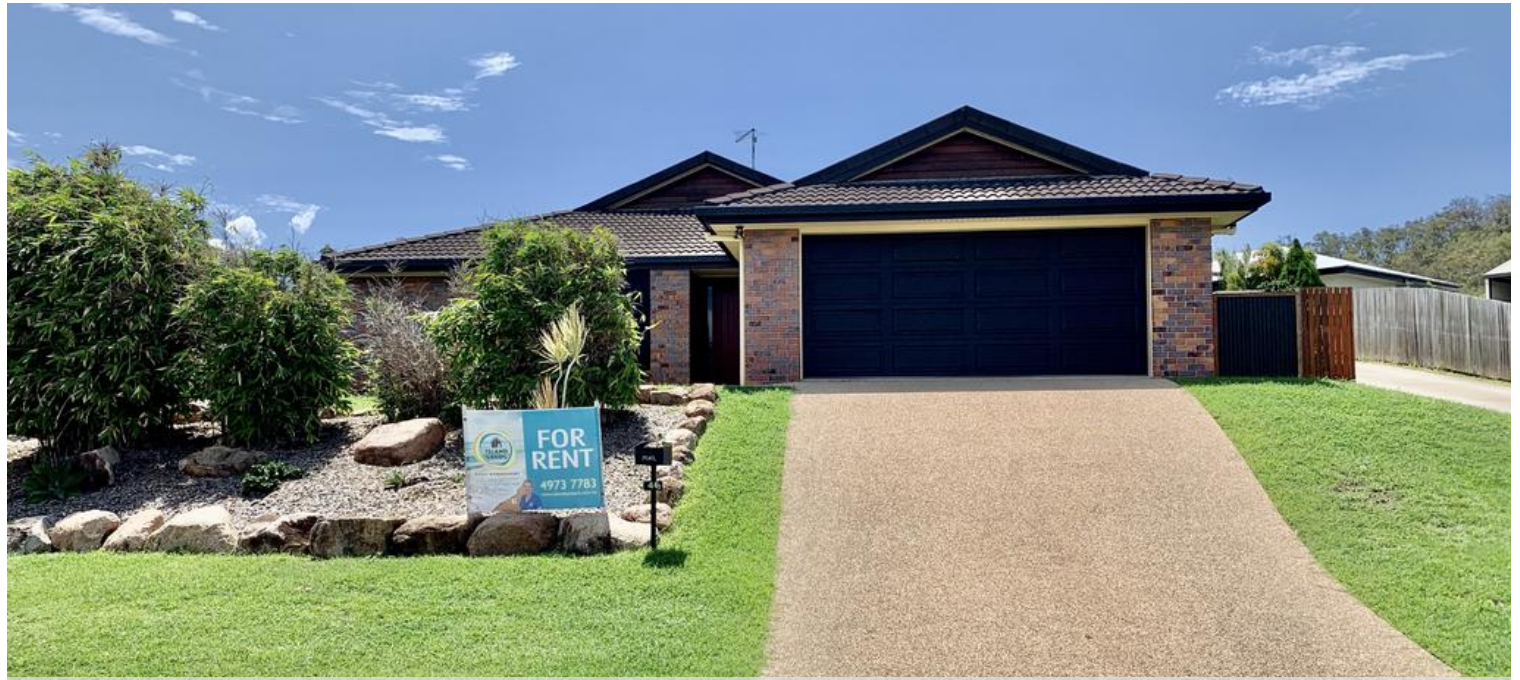
46 Bauhinia Street, Boyne Island